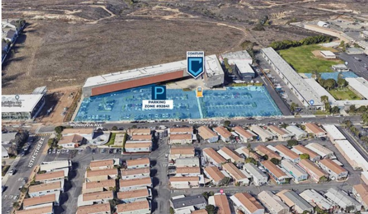
Coastline Newport Beach Campus