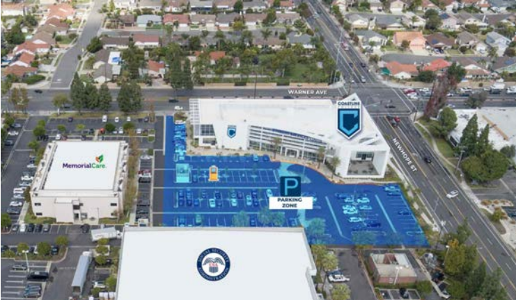
Coastline Fountain Valley Student Services Center